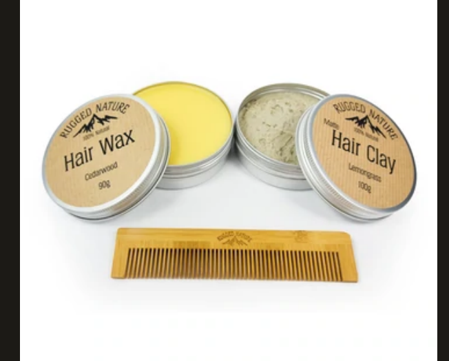
Rugged Nature Hair Styling Kit