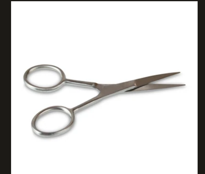
Beard Trimming Scissors