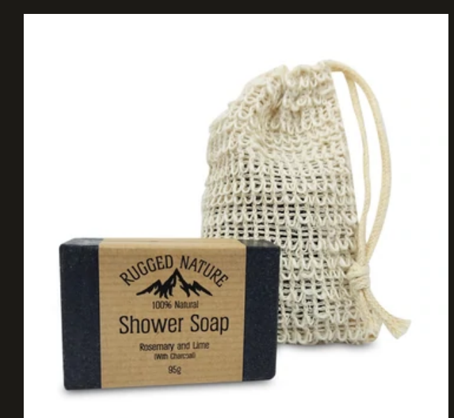
Rugged Nature Shower Soap Starter Kit