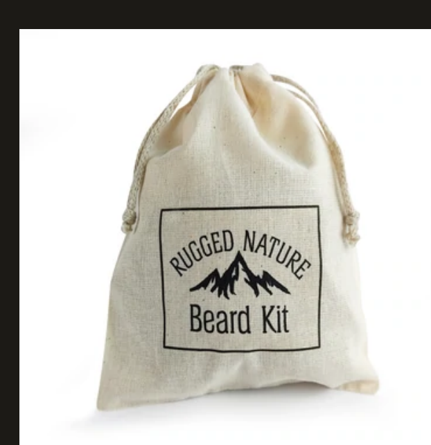
Rugged Nature Small Cotton Drawstring Bag