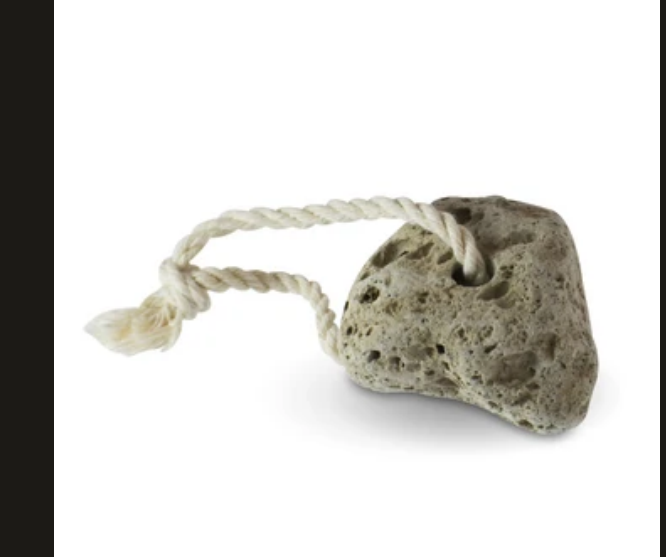
Natural Pumice Stone