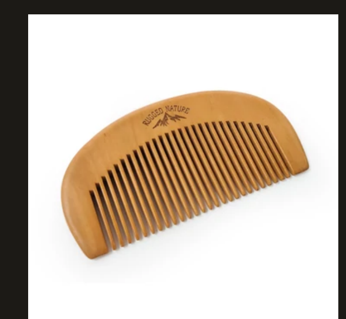
Small Wooden Comb