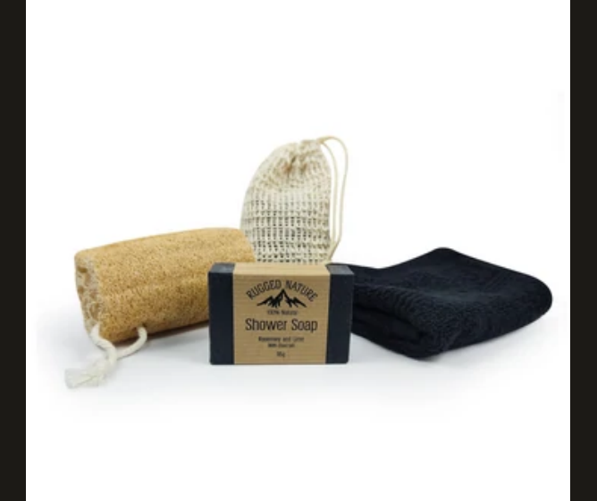
Rugged Nature Shower Kit