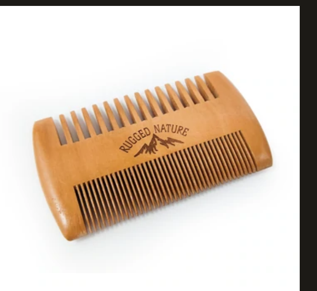
Double Sided Beard Comb