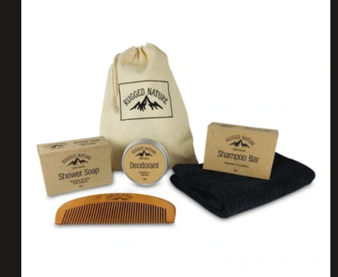
Rugged Nature Essentials Kit