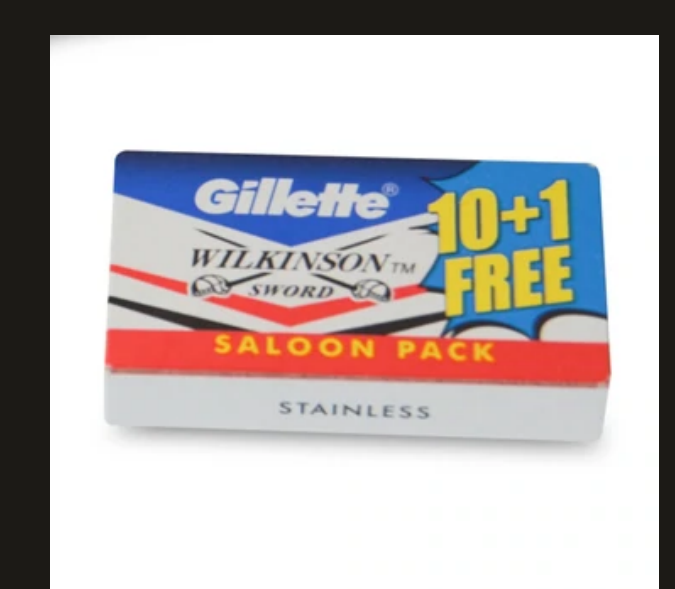
Pack of 10 Stainless Steel Razor Blades