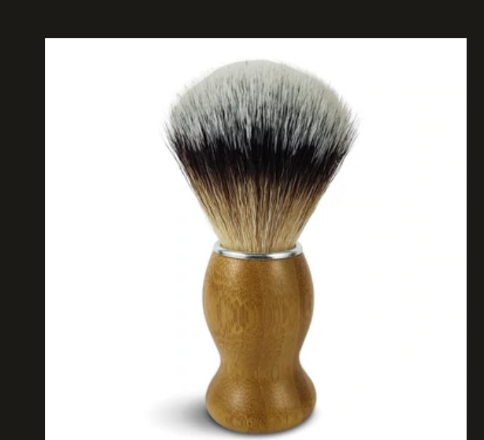
Rugged Nature Shaving Brush (New