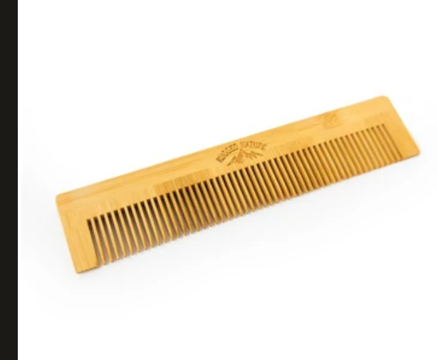
Bamboo Pocket Comb £1.75