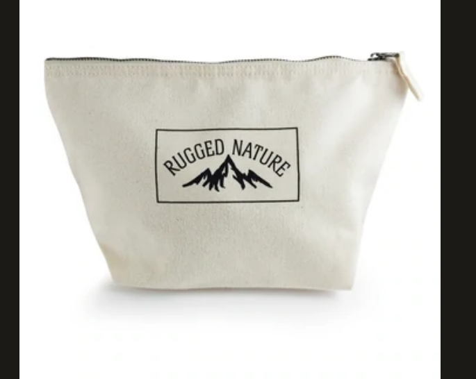
Rugged Nature Wash Bag