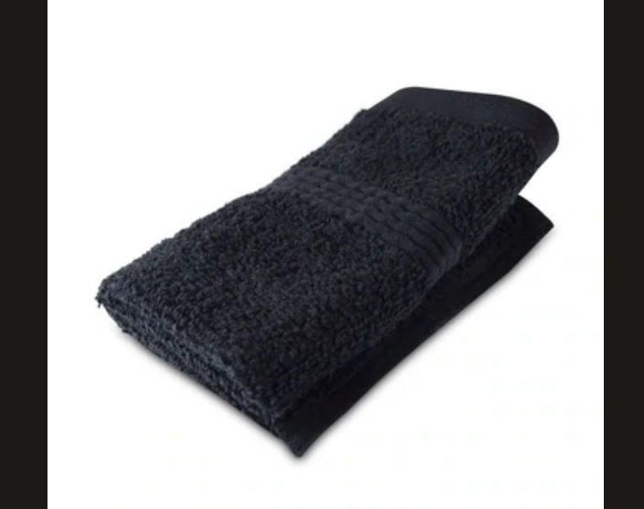
Rugged Nature Cotton Face Cloth