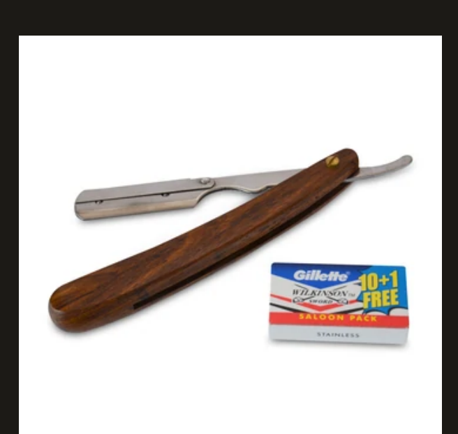
Rugged Nature Straight Razor