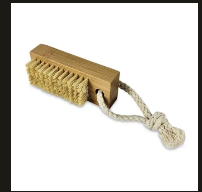
Bamboo and Sisal Nail Brush